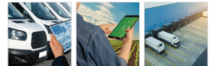
Asset & Workforce Tracking