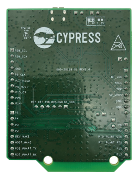
Figure 2: CYBT-243053-EVAL Bottom View

SW1: Reset Switch routed to the XRES connection on the module.