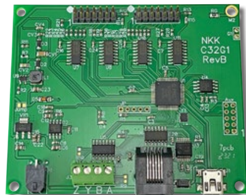
IS-C32G1 Intelligent Controller