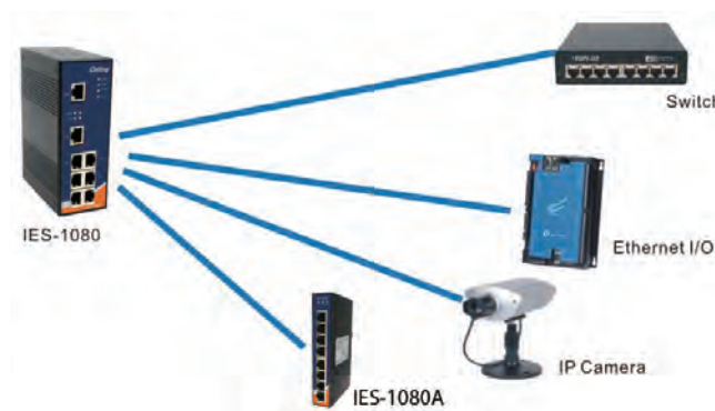
Connections of Ethernet devices

IES-1080/1062 series can be used in connecting several Ethernet devices like Ethernet I/O, IP-Camera or other Ethernet switches. In addition, there are three different power inputs to enhance its reliability, two supplied by terminal block, and one by power jack to avoid interruption caused by power down. When the primary DC power input fails, the backup power input will take over immediately to guarantee a non-stop operation.