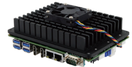
IB918 with heatsink