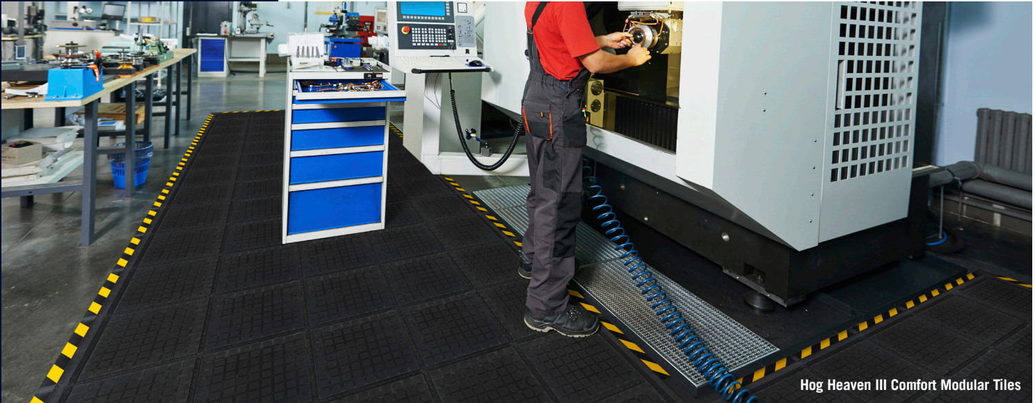
Hog Heaven III Comfort Modular Tiles