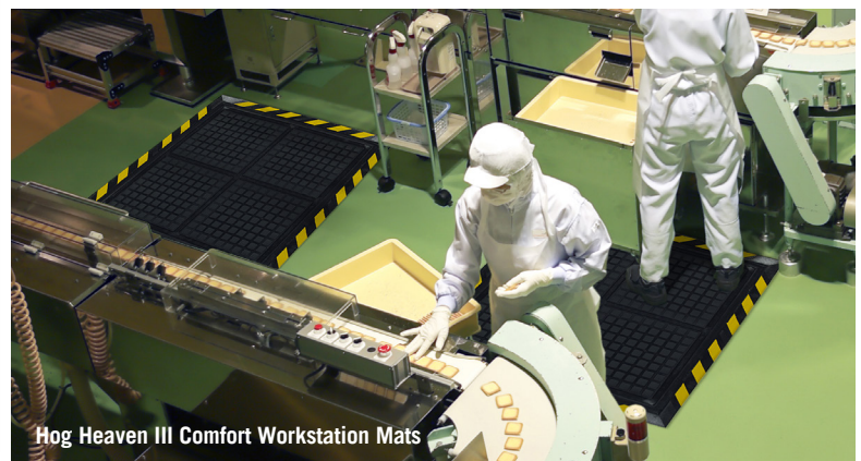
Hog Heaven III Comfort Workstation Mats