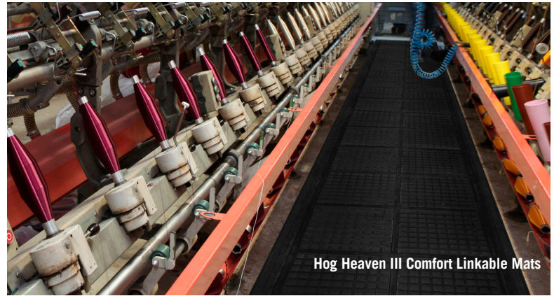
Hog Heaven III Comfort Linkable Mats

Note: Mat sizes are approximate as rubber shrinks and expands in conjunction with temperature and time. Tolerable manufacturing size variance is 3-5%.