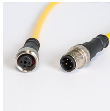
Male and Female 4-pole