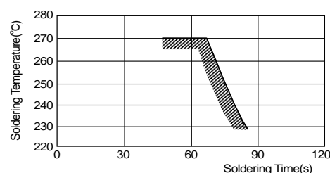
[Allowable Reflow Soldering Temperature and Time]

In the case of repeated soldering, the accumulated soldering time must be within the range shown above.