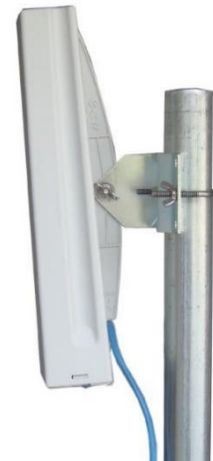
EZ-Bridge® LT tool-less installation