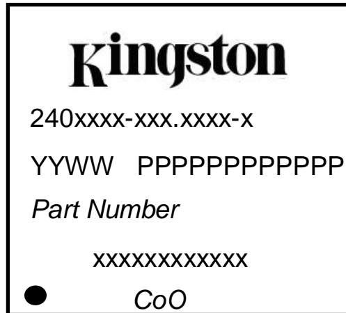
Figure 4 - EMMC Package Marking