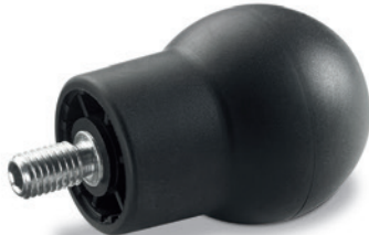
ERGOSTYLE® ELESAs Original design

The coating, with "soft-touch" elastomer, improves the grip even in the presence of oils, greases and sweat from the hand. For this reason it is suitable for fitness machines, tools and machines for gardening and goods transport, high-precision instruments and disability aids.