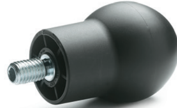
ERGOSTYLE® ELESAs Original design

Zinc-plated steel pin, hexagon socket at threaded end.