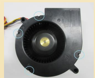
Outlet Drain Holes