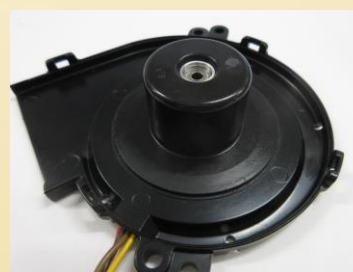
Epoxy resin coating of motor (IP68)