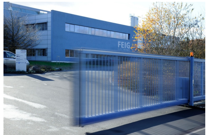
Perimeter Protection: Fast and safe access to industrial plants etc.

Suitable loop detectors and motion detectors are available from FEIG ELECTRONIC.