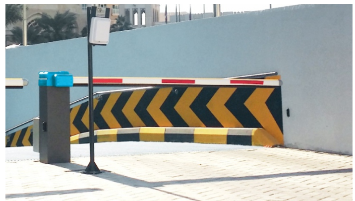
Parking Management: Comfortable access without waiting