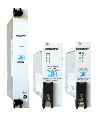
COMPACTPCI® SERIES FRONT VIEW