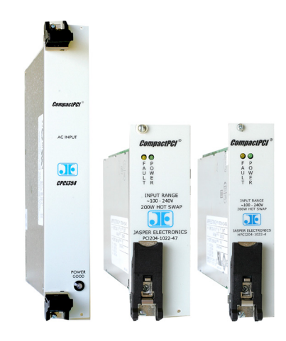
COMPACTPCI® SERIES FRONT VIEW