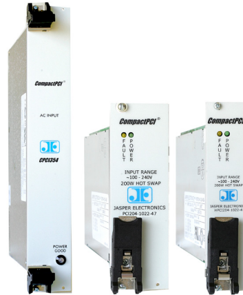
COMPACTPCI® SERIES FRONT VIEW