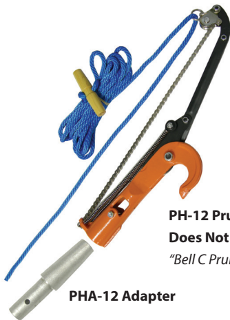
PH-12 Pruner with 1.5" Center Cut Does Not Accommodate Saw Blade "Bell C Pruner"