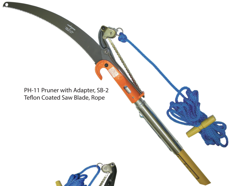
PH-11 Pruner with Adapter, SB-2 Teflon Coated Saw Blade, Rope

Jameson's steel PH pruners have become the standard in telecommunications and CATV for trimming around aerial lines or drops. Both models feature a chain pulley and center cut blade.