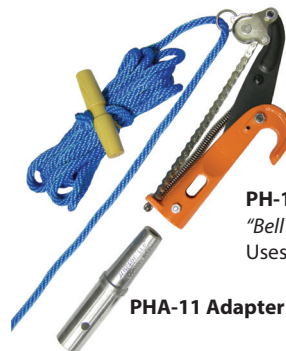
PH-11 Pruner with 1" Center Cut "Bell B Pruner" Uses SB-1T or SB-2 Saw Blade