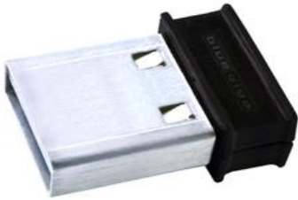
Figure 1: BLED112 Bluetooth Low Energy USB dongle

BLED112 Bluetooth Low Energy Dongle integrates all Bluetooth Low Energy features. The USB dongle can a virtual COM port that enables simple host application development using a simple application programming interface. The BLED112 can be used for Bluetooth Low Energy development. With two BLED112 dongles you can quickly prototype new Bluetooth Low Energy application profiles by utilizing Bluegiga Profile Toolkit™ and also automate in module software functions with Bluegiga BGScript™.