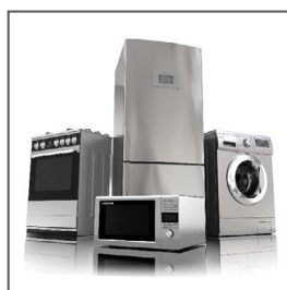
Home Appliance (White Goods)