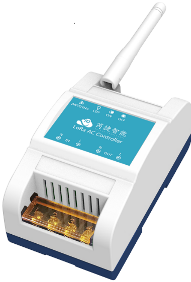
Pic 1-1 Front