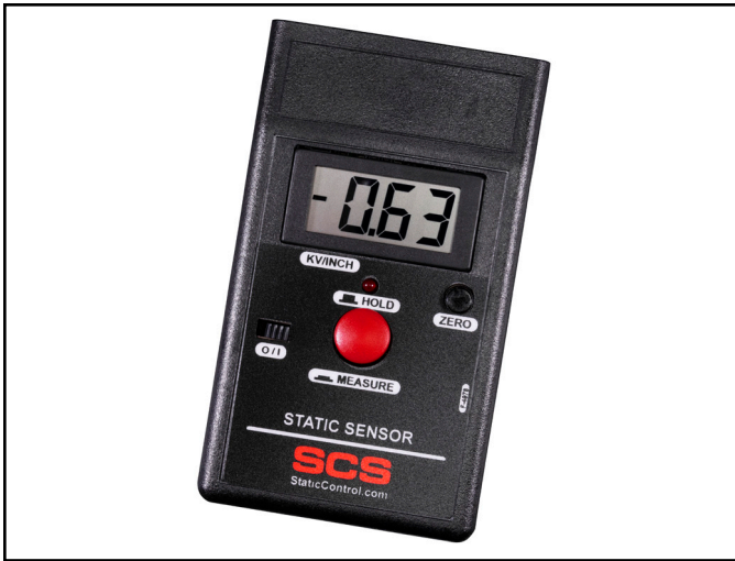
Figure 1. SCS 770716 Static Sensor