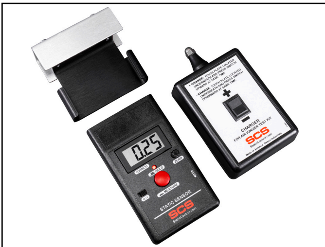
Figure 2. SCS 770717 Air Ionizer Test Kit