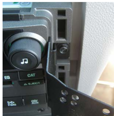
Mounting Location Picture - All