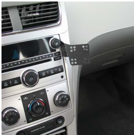
Final Installation Picture