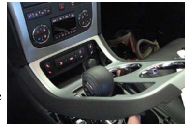
Shifter Console Removal

INSTALLATION IS NOW COMPLETE. ENJOY YOUR NEW INDASH by PANAVISE MOUNT.