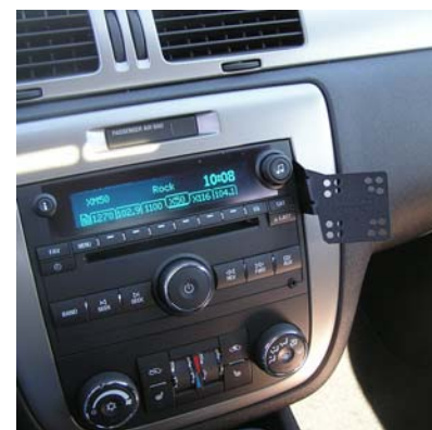
Impala, Monte Carlo Install Picture

Read instructions completely prior to starting installation. All InDash Mounts are designed so that after installation, phone is facing normal driver position for left-hand drive vehicles. This mount is not designed to be used in foreign countries with right-hand drive vehicles. Use extreme care when working around the plastic components on the dash. Excess force, can cause breakage of the plastic components.