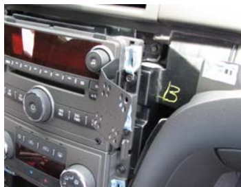
Mount in Place