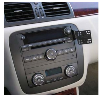
Buick Lucerne 2006 Mount Installed