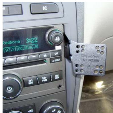
HHR Install Picture