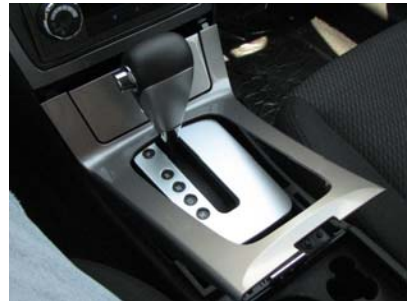
Shifter Bezel Removal