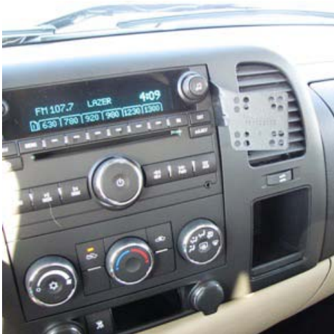
Installation of InDash Mount on Work Truck dash