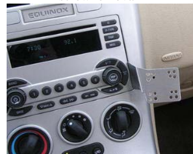
Lower Installation Location