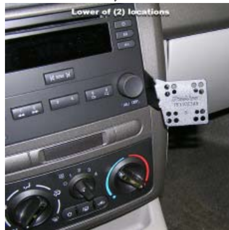
InDash Lower Mounting Location