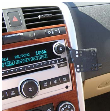
InDash installed showing upper location on new style radio.