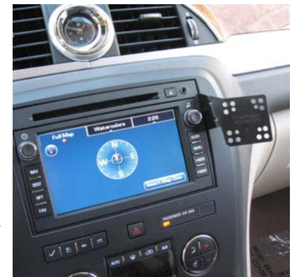
Buick Enclave Final Install Picture