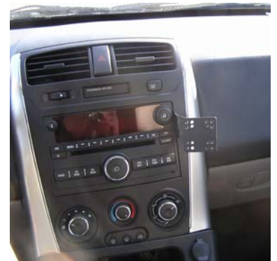
Saturn Vue 2006 Final Installation Picture

STEP #4: Replace the bezel carefully starting from the right side by the Installed Mount. INSTALLATION IS NOW COMPLETE. ENJOY YOUR NEW INDASH by PANAVISE MOUNT.