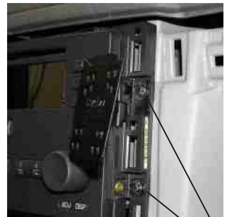
Upper Mounting Location Screw Lower Mounting Location Screw