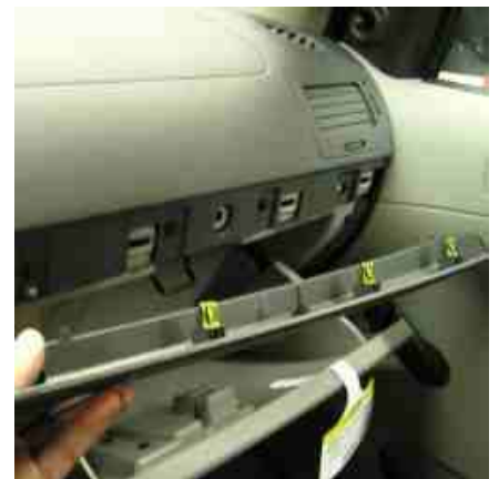
Trim Strip Removed

INSTALLATION IS NOW COMPLETE. ENJOY YOUR NEW INDASH by PANAVISE MOUNT.