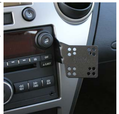
Saturn Ion Final Installation Picture