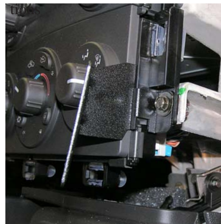
Mount installed showing location