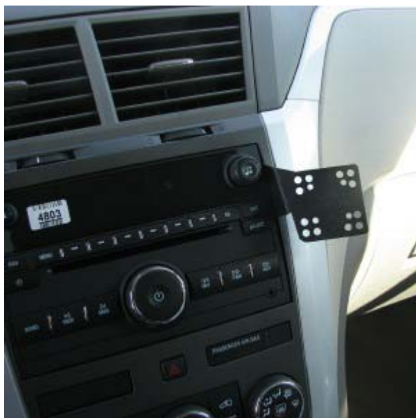
Installation of InDash Mount

INSTALLATION IS NOW COMPLETE ENJOY YOUR NEW INDASH by PANAVISE MOUNT