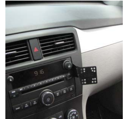
Suzuki XL-7 Final Install Picture