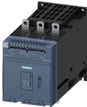
SIRIUS soft starter 200-600 V 171 A, 110-250 V AC Screw terminals Analog output