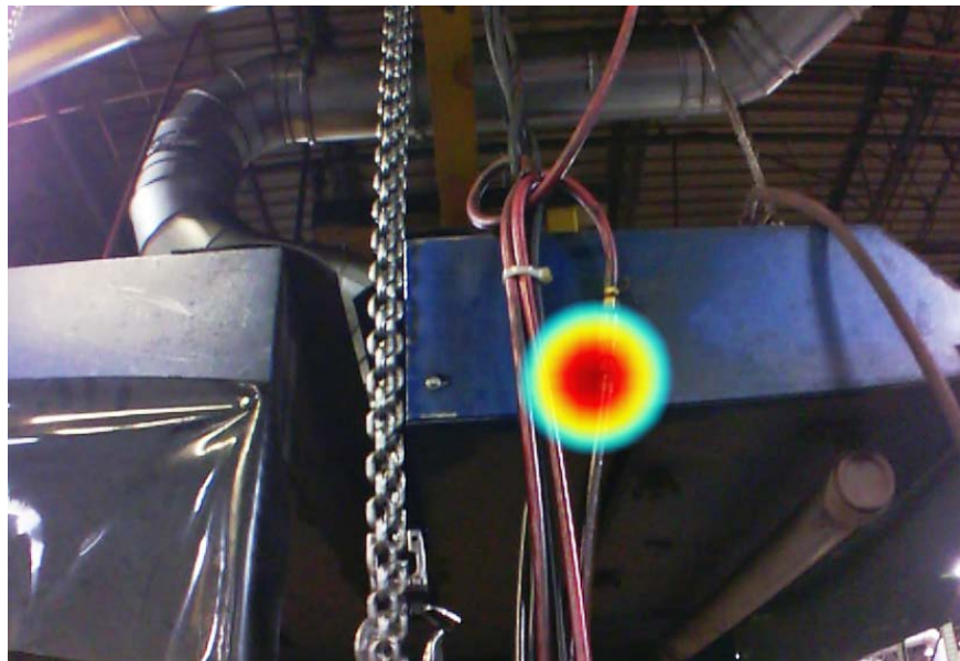
Images taken with the ii900 Sonic Industrial Imager in an industrial environment.

Fluke. Keeping your world up and running.®