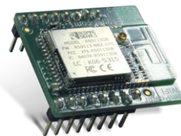
Redpine Signals RS9113