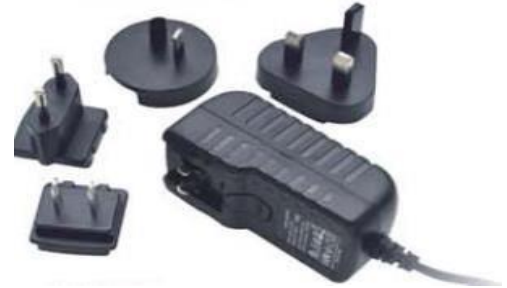
*Product images are for illustrative purposes only and may vary from actual design.