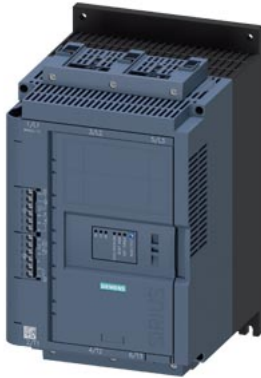
SIRIUS soft starter 200-600 V 63 A, 24 V AC/DC Screw terminals Thermistor input