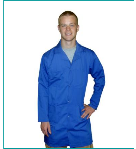
Model: JLC5402– JLC5409 Collared ESD Lab Coats: Small - 5XL