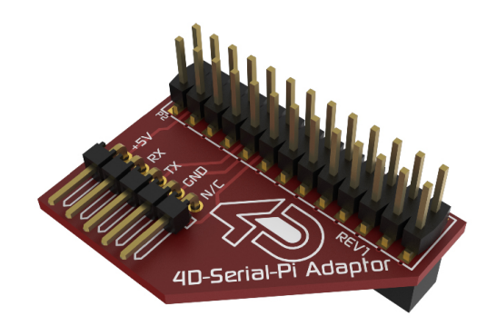
4D Pi Serial Adaptor