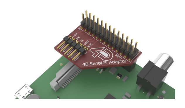
4D Pi Serial Adaptor attached to a Raspberry Pi