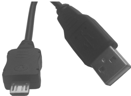
USB A MALE TO USB MICRO 5PIN