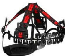
3M™ SecureFit™ H-Series Hard Hat Suspension Replacement