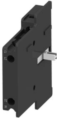
Auxiliary switch block, for 3TB52...3TB56, 3TC52, 3TC56, left