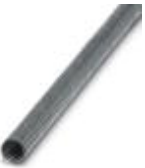
Protective hose in stainless steel

Protective hose - WP-STEEL S 14 - 3240687