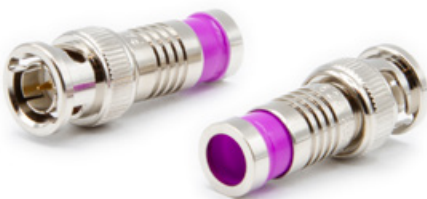
302-8241CSTP BNC Male Compression Seal