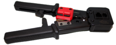
GET-HSCT CAT5/5e/6 High-Speed Crimper