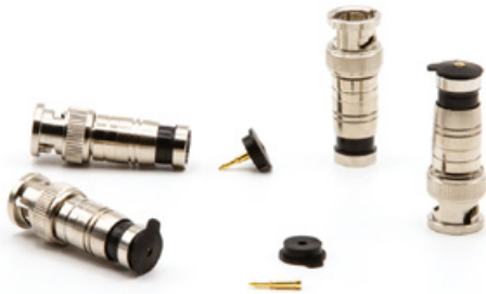
302-00CSTP Universal BNC Male Compression Seal