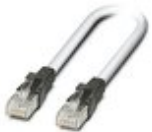
Patch cable, CAT5, assembled, 2 m

Patch cable - FL CAT5 PATCH 2,0 - 2832289