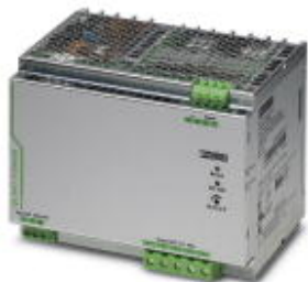
Primary-switched QUINT POWER power supply for DIN rail mounting with SFB (Selective Fuse Breaking) Technology, input: 1-phase, output: 24 V DC/40 A

Please be informed that the data shown in this PDF Document is generated from our Online Catalog. Please find the complete data in the user's documentation. Our General Terms of Use for Downloads are valid ( http://phoenixcontact.com/download )