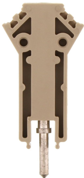
Test adapter, Length: 37.3 mm, Pitch size: 5 mm, Colour: Beige