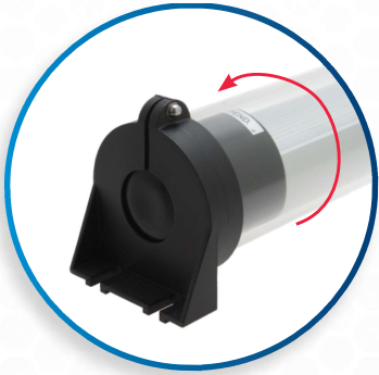
120 ° Adjustable Illumination