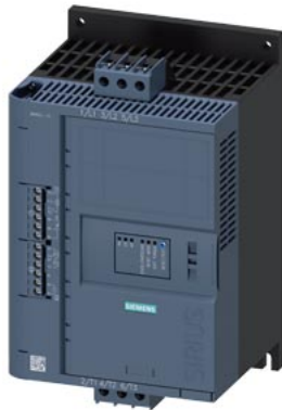
SIRIUS soft starter 200-480 V 32 A, 110-250 V AC Screw terminals Thermistor input