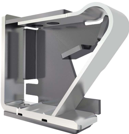
Solid PUSH IN contact Safe and durable