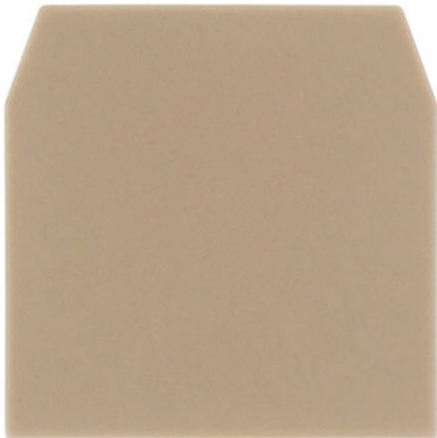
End plate, Width: 1.5 mm, Colour: Beige