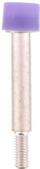
Mounting screw, M 2.5, Colour: Violet