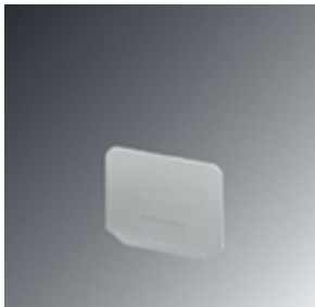
End cover, Width: 2.3 mm, Color: gray

Please be informed that the data shown in this PDF Document is generated from our Online Catalog. Please find the complete data in the user's documentation. Our General Terms of Use for Downloads are valid ( http://phoenixcontact.com/download )