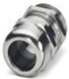
Cable gland, Cable gland material: Brass, nickel-plated, External cable diameter 13 mm ... 18 mm, Shielding: No, Connecting thread: Pg21, Color: silver

Cable gland - G-INS-PG21-M68N-NNES-S - 1411175