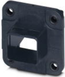
Panel mounting frames, Degree of protection: IP65/67, Material: Plastic

Please be informed that the data shown in this PDF Document is generated from our Online Catalog. Please find the complete data in the user's documentation. Our General Terms of Use for Downloads are valid ( http://phoenixcontact.com/download )