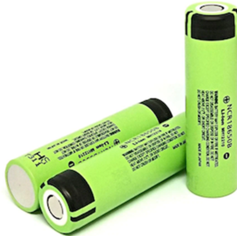
Photo Reference for Panasonic NCR18650B Flat Top 3400mAh Battery

Please kindly know that there is no battery in the package, while the battery is available in regular convenience stores and customers need to prepare themselves. And what we propose is Panasonic NCR18650B Flat Top 3400mAh Battery .