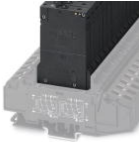
Thermomagnetic circuit breaker, 2-pos., normal blow, 1 N/O contact and 1 N/C contact

Please be informed that the data shown in this PDF Document is generated from our Online Catalog. Please find the complete data in the user's documentation. Our General Terms of Use for Downloads are valid ( http://phoenixcontact.com/download )